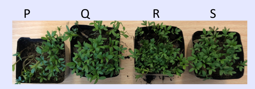
Figure 7. Cress grown in different media. Key: P – top layer of sour fig, Q = bought compost, R = bottom layer of sour fig, S – soil from near the school car park