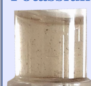
Figure 5 Soil from Area G Speckled potassium test using bought kit. This shows adequate potassium.