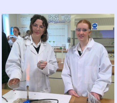
Figure 6 Soil from Area G The flame test did not work because the flame colour was yellow which is sodium and masked the faint lilac of the potassium.

Figure 5 Soil from Area G Speckled potassium test using bought kit. This shows adequate potassium.