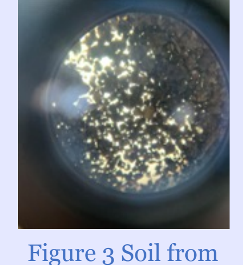
As all the sample were taken from coastal areas, quartz and mineral grains of sand were visible in all the samples except those from recently removed sour fig which were full of organic matter. Areas that had sour fig removed many years ago were similar to the surrounding sandy soil.