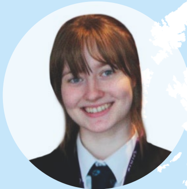
Student, Limavady Grammar School