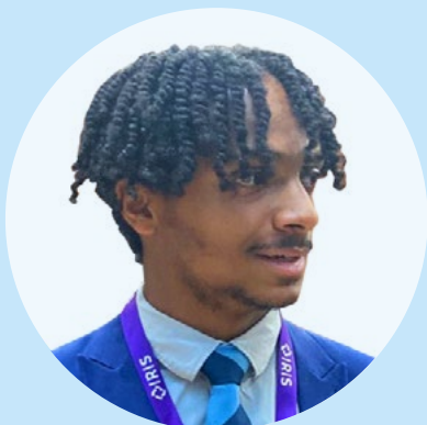
Student, Queen Elizabeth’s School

“IRIS is a breath of fresh air that has supported students and staff in our school to conduct research that would never be possible without their help. There is no stress, no planning, just a premade project for you to pick up and enjoy. The only thing you need is enthusiasm and resilience.”