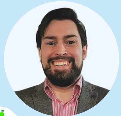
Chemistry teacher, St John Fisher Catholic Voluntary Academy

“Instead of just reading from a book, I had the chance to figure out what works and doesn’t. So the learning stuck with me.”